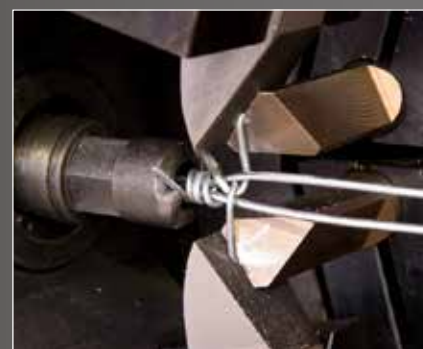
DETAIL OF BARB KNOTTING PROCESS

This document contains information and Brands proprietary to Eurolls SpA. Eurolls SpA has a policy of progress development of its products and reserves the right to alter without notice the information within this document.