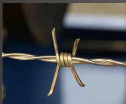
DETAIL OF IOWA 4 BARBS