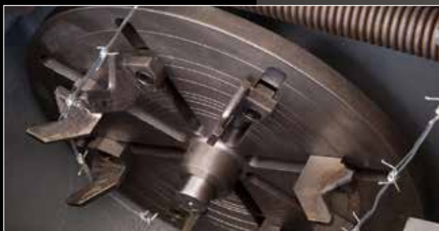
BARBED WIRE WHEEL EXTRACTOR

This machine can produce all kinds of galvanized or plastic coated mild steel barbed wire. Each machine is single motor driven and is equipped with a four speed gear box in oil bath. This vertical machine solution enables very easy access during normal set-up and maintenance operations. The winding reel is perfectly balanced and is equipped with a swivel container into which the finished reel is unloaded. The rolls can weigh up to 50 kg max. (100 lbs). The machine can cater for wooden winding reels too.